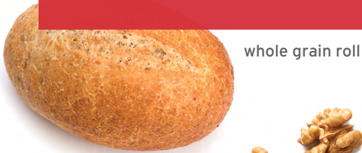
whole grain roll

Eating a variety of delicious foods and cutting back on salt can help lower your blood pressure. What are you waiting for? Take control of your heart health with the DASH eating plan.